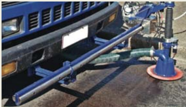
Linear rail & carriage