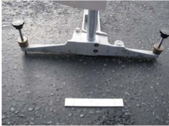
Figure 2. Before treatment