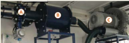
A) Atmospheric valve B) Accumulator C) Regenerative blower