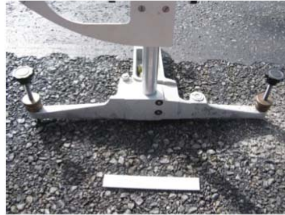
Figure 3. After treatment.